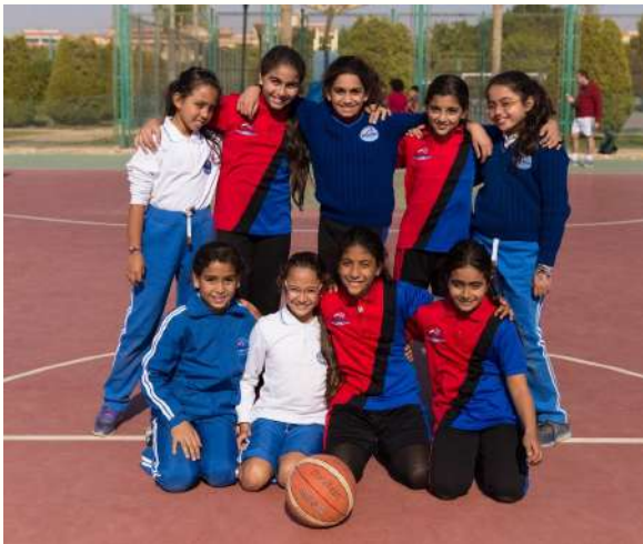
U11 Girls Basketball Team

Under 18 Girls Basketball: TBS 7 – MCE 17