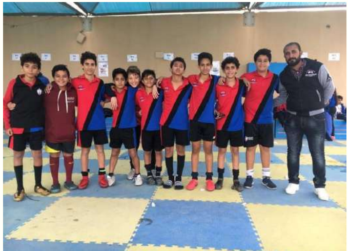
Boys Football Team