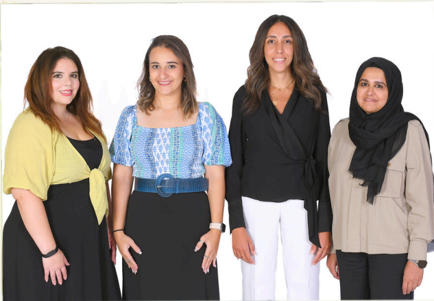
Y5 Class Teachers