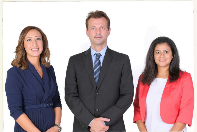
Commercial Studies Department