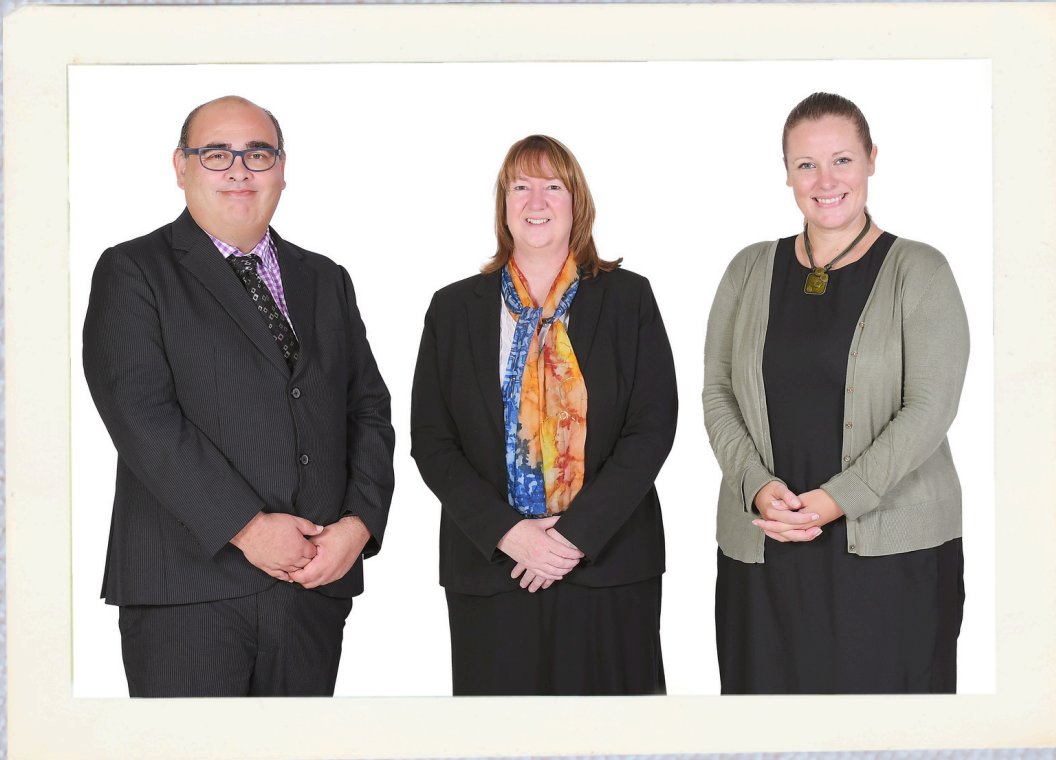
GMS TBS SLT