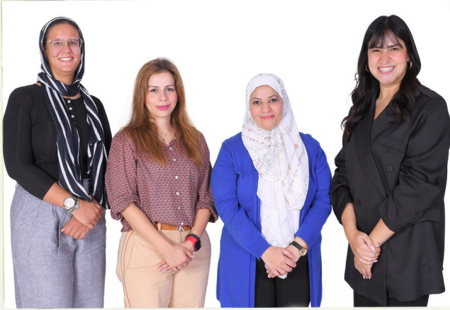
Pre-School & FS1 Class Teachers