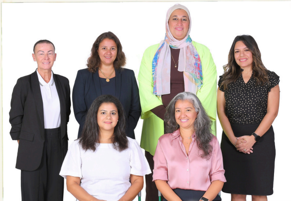
Heads of years