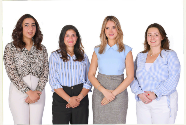
Y2 Class Teachers