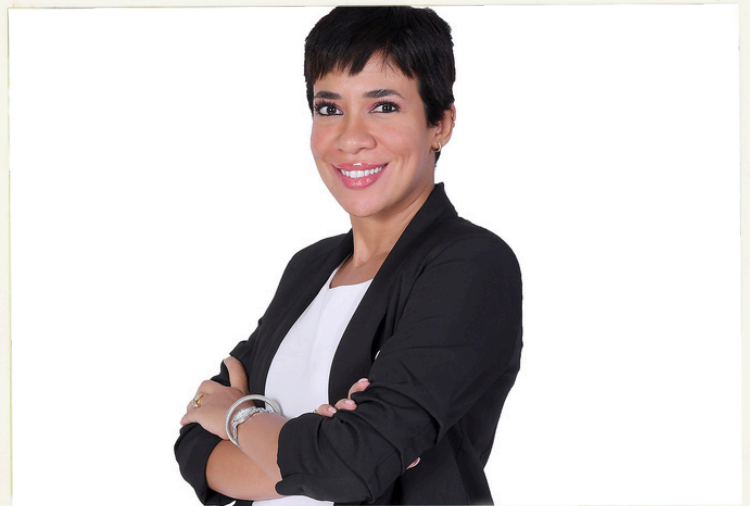
Careers & University guidance Counselor