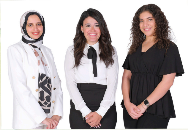
Y1 Class Teachers