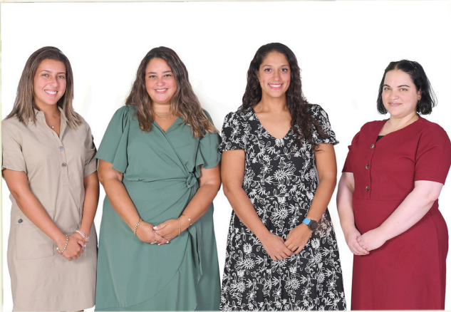
Y3 Class Teachers