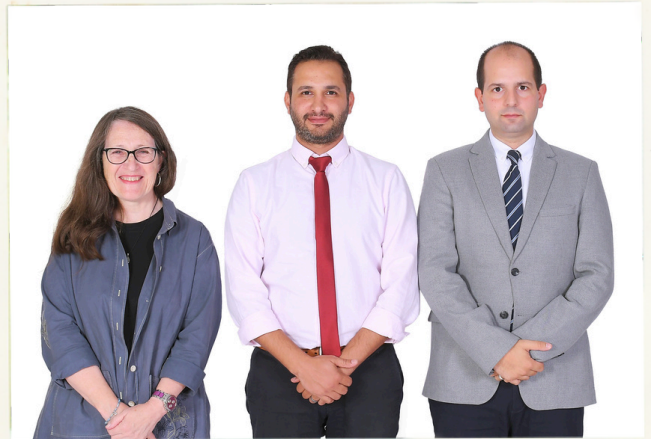
Y6 Class Teachers