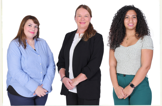
FS2 Class Teachers