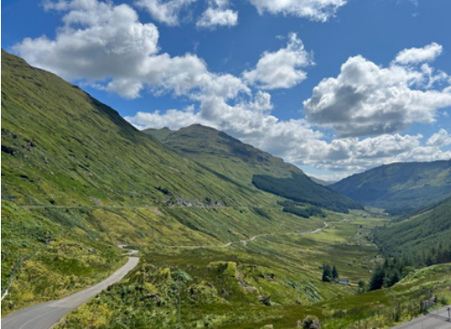
A clear day at the top of the rest and Be Thankful

I trust that your summer holidays were filled with moments of joy, relaxation, and quality time spent with family and friends. Whether you traveled to new destinations, explored new hobbies, or simply enjoyed the pleasures of a slower pace, I hope the break has left you recharged and ready to embrace the exciting opportunities that lie ahead. I spent the summer with my family near Glasgow in Scotland. Despite there being very few days when it did not rain, it was lovely to visit favourite places and catch up with friends.